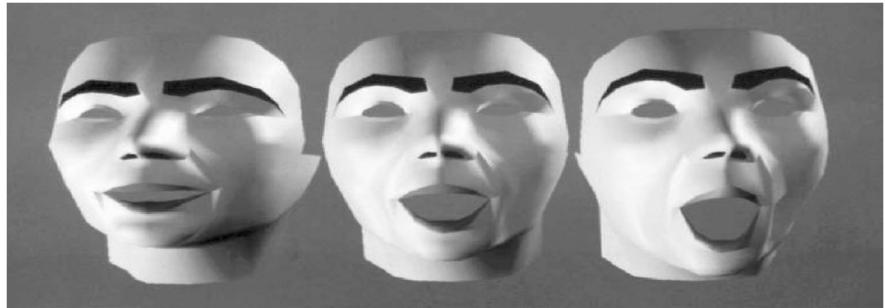
Fig. 4 Expressions interpolation

underlying approaches. The facial animation control might be observed as control parameterization and control interface issues. Improvement of control parameterizations and improvement of animation system implementations must be separate.